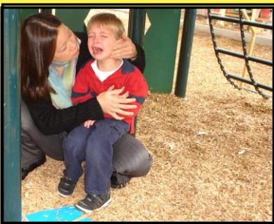
Being comforted by a teacher.