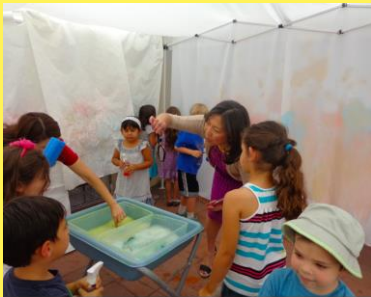
Painting "the walls"