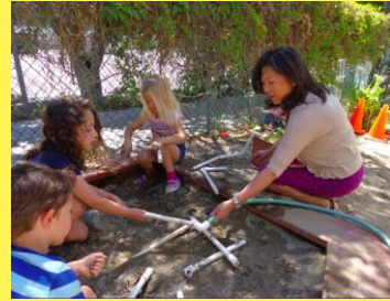
Children give away half of what they grow – fruit, vegetables, plants, flowers