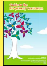
Consistent with Hong Kong Guide to the Pre-Primary Curriculum