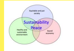
Excellent framework for Education for Sustainable Development (ESD)

HighScope would probably look quite different in HK and USA!