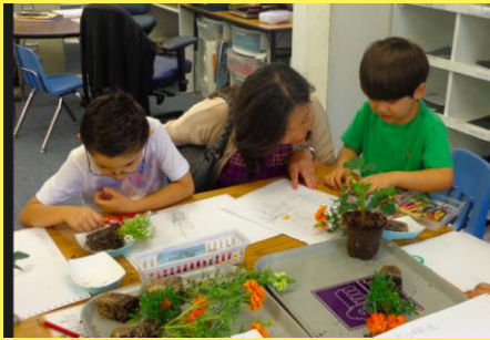
Drawing plants for science