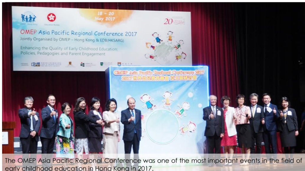
The OMEP Asia Pacific Regional Conference was one of the most important events in the field of early childhood education in Hong Kong in 2017.