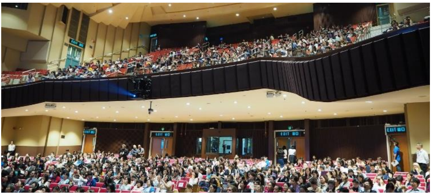
The conference attracted over 1000 participants from Hong Kong and around the world.