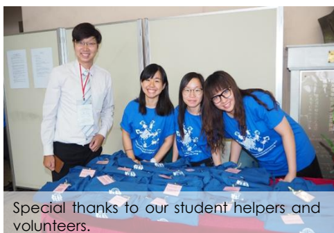
Special thanks to our student helpers and volunteers.

We were most gratified to co-organise the Conference with the Education Bureau (EDB) of the Hong Kong Special Administrative Region (HKSAR) and to partner with five universities, including Hong Kong Baptist University, The Chinese University of Hong Kong, The Education University of Hong Kong, The Open University of Hong Kong and The University of Hong Kong.